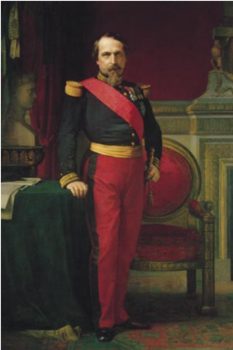
EMPEROR NAPOLEON III. On December 2, 1852, Louis Napoleon took the title of Napoleon III and then proceeded to create an authoritarian monarchy. As opposition to his policies intensified in the 1860s, Napoleon III began to liberalize his government. However, a disastrous military defeat at the hands of Prussia in 1870–1871 brought the collapse of his regime.

Napoleon's policies began to mount, his sensitivity to the change in the public mood led him to undertake new policies liberalizing his regime. As a result, historians speak of the "liberal empire" for the latter part of the 1860s.